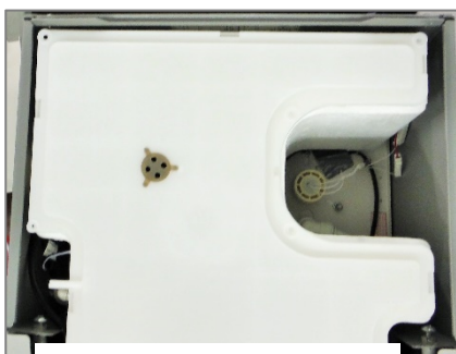
Reservoir Tank Cover