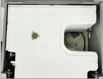
Reservoir Tank Cover